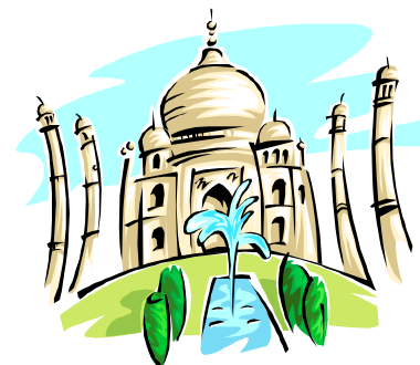
Palm Beach County has three mosques: Boca Raton, Lake Worth and Belle Glade