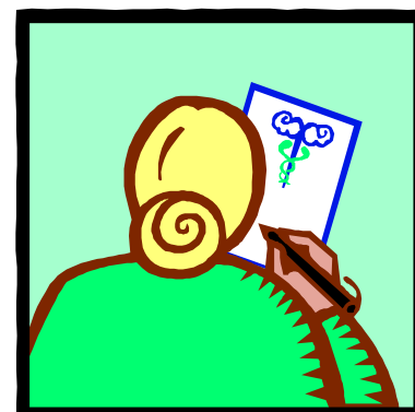
Faith-based nurses assist individuals so that they do not "fall through the cracks" of our healthcare system.